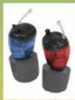
CENS Mino Digital

We also distribute PELTOR earmuff and NYX Sport shooting glasses