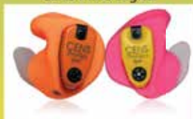
CENS ProFlex Digital Custom