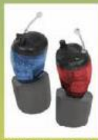
CENS Mino Digital

We also distribute PELTOR earmuff and NYX Sport shooting glasses