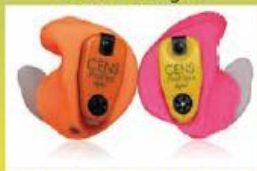
CENS ProFlex Digital Custom